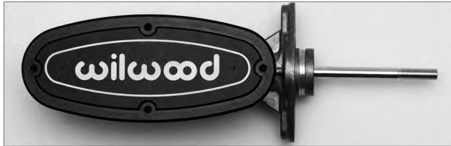
Photo 2. Left side of master cylinder